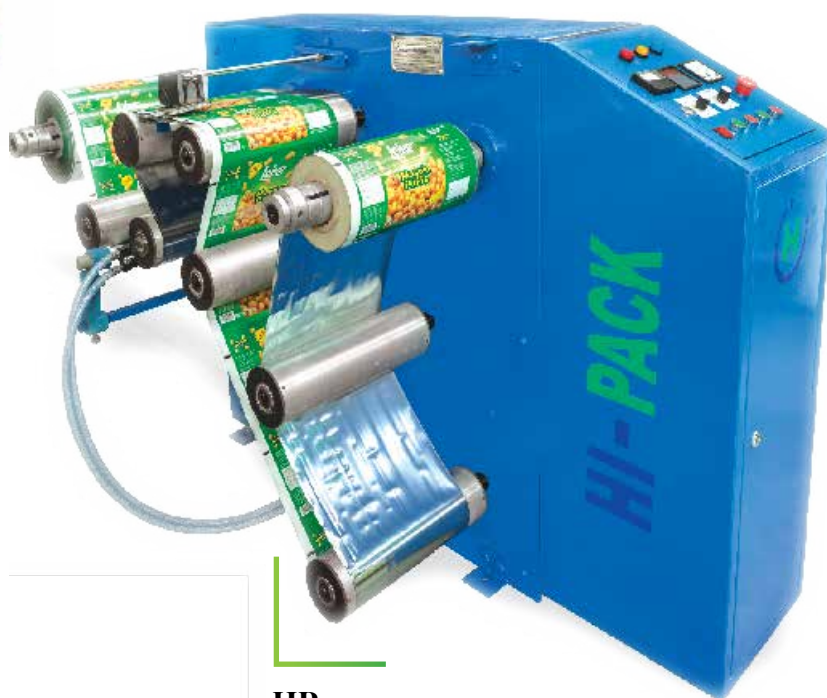
HP-109 Rewinding Machine