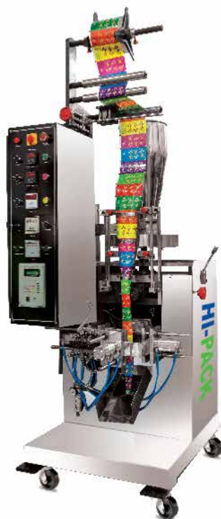
HP-095 Semi-Pneumatic Triangle Pack