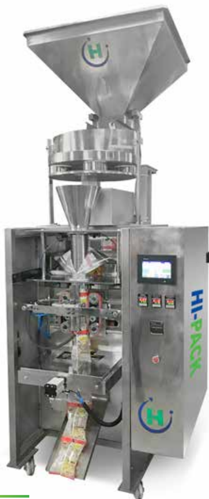
HP-101 Pneumatic Collar Type Machine