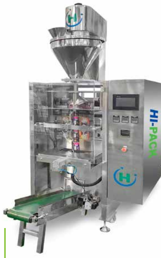
HP-102 Hi-Speed Collar Type Machine