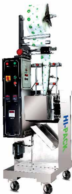
HP-094 FFS Three/Four Side Seal