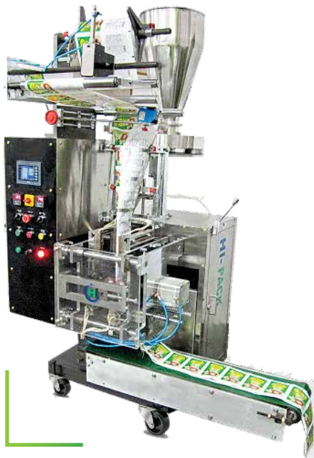
HP-094A Pneumatic Single Track