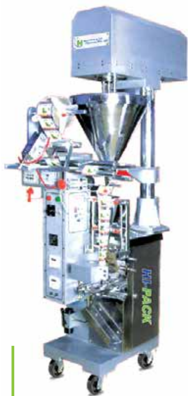
HP-097 FFS Auger Filler