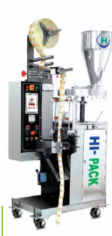
HP-099A FFS Three Side Sealing