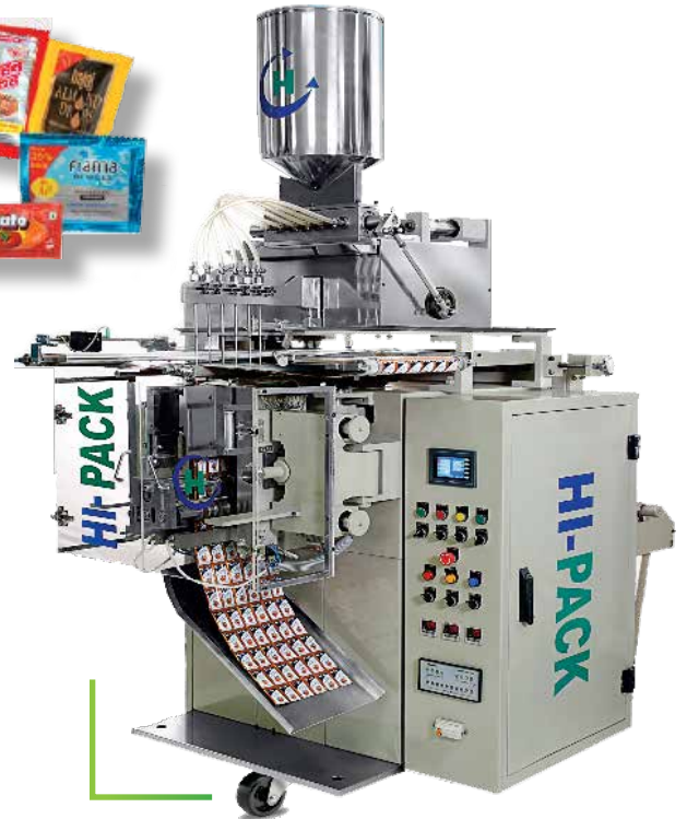
HP-106 Pneumatic Six Track