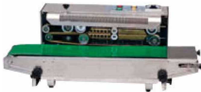
HP-105 Continuous Band Sealer