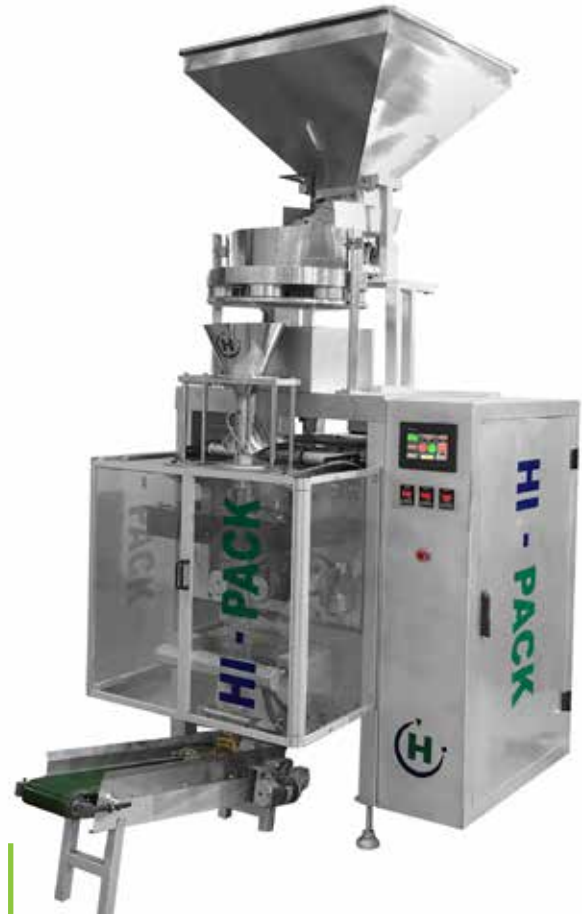
HP-103A Hi-Speed Collar Type Machine