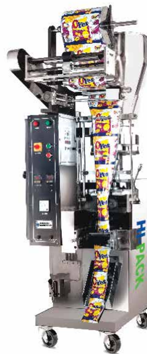
HP-096 FFS Center/Four/Three Side Seal