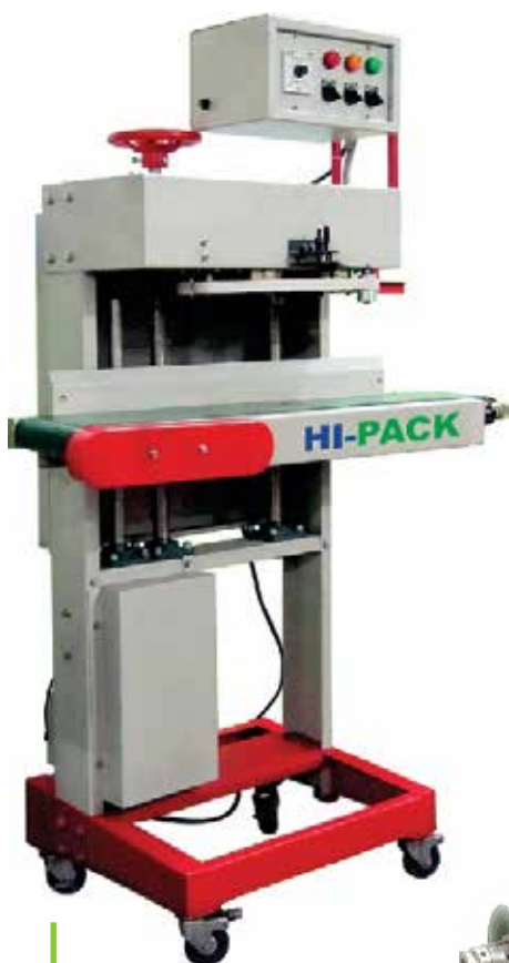
HP-105A Continuous Band Sealer