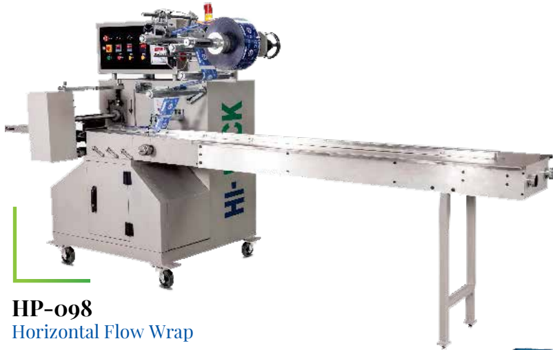
HP-098 Horizontal Flow Wrap