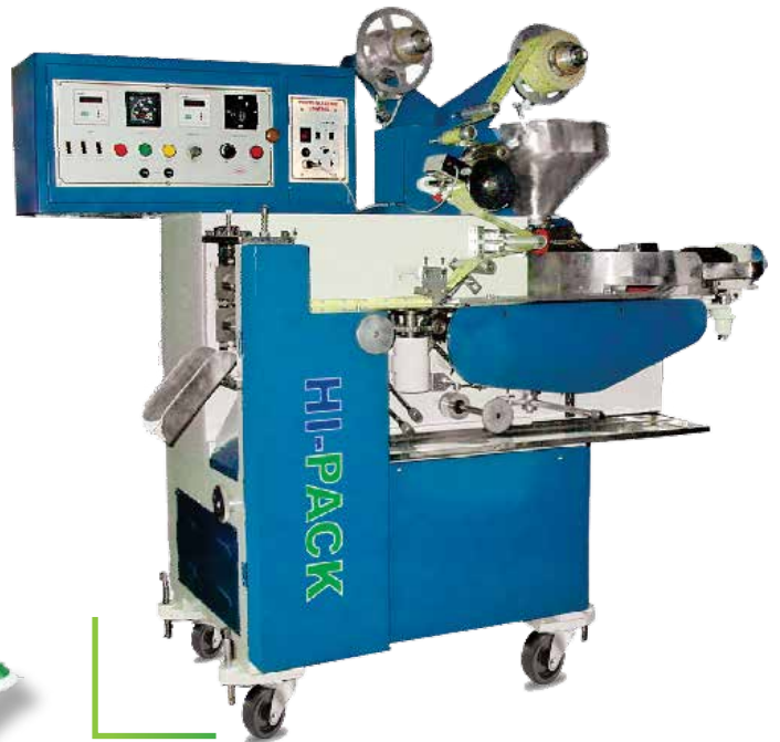
HP-100 Candy Pillow Pack