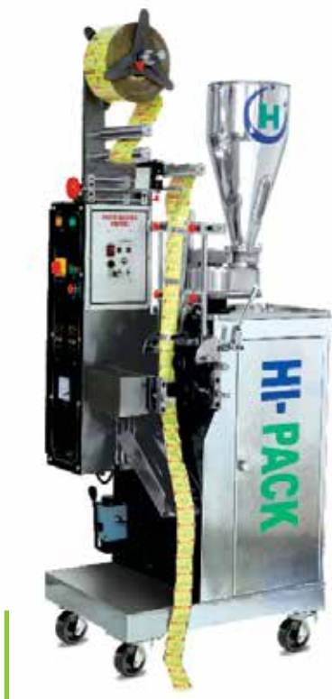
HP-099 FFS Three Side Sealing